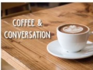
COFFEE & CONVERSATION